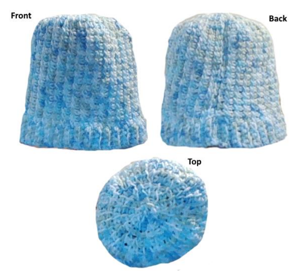
Cross Stitch Baby Hat For 0-3 month size By Marilyn [Ameigh] Moore www.AmeighsBabyCrochet.com