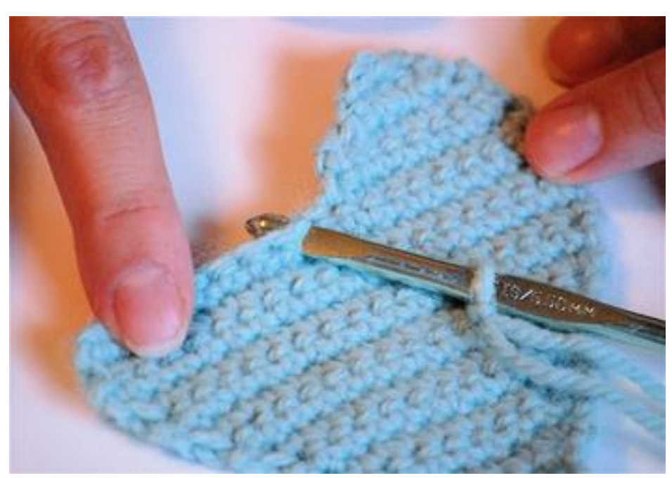
Row Fifteen Part II: Sc into 9th sc from the left side. (There will be one unused sc in the middle of row fifteen).

Complete row with 8 more sc, chain 1 and turn. Total stitches in the row is 9.