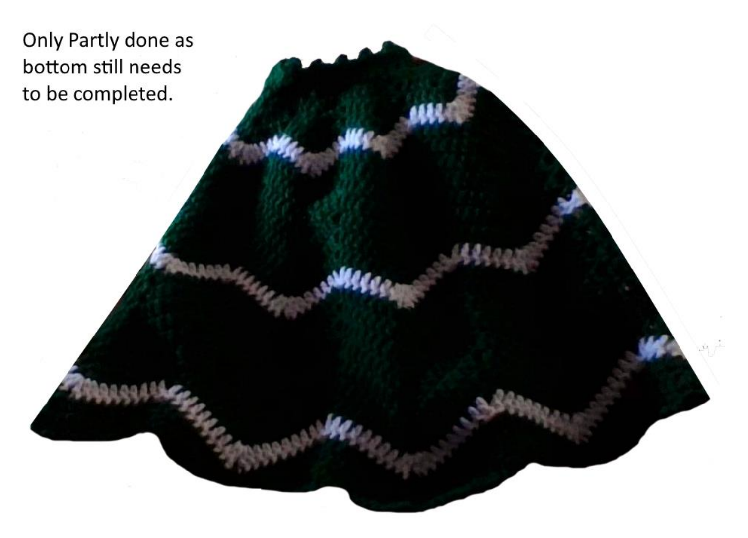
Above Poncho is folded in half horizontally.