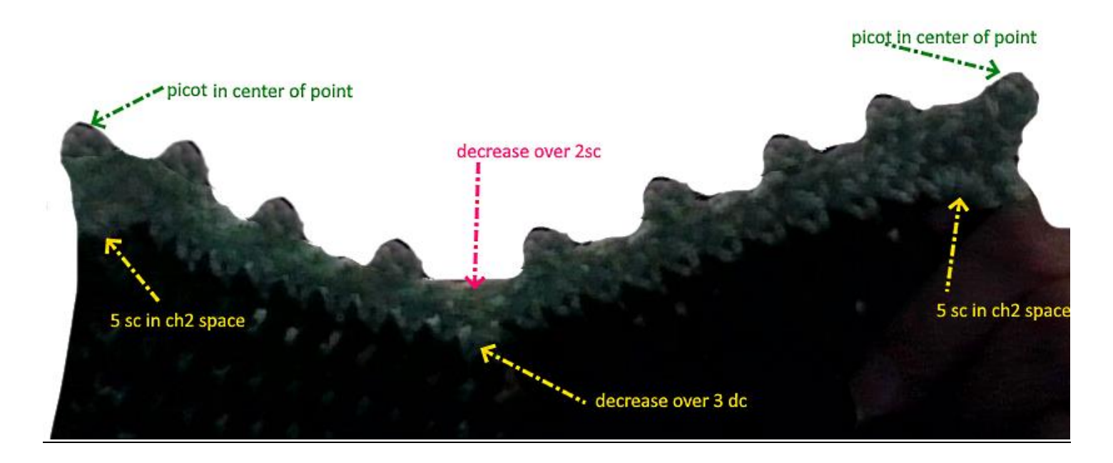
Row 1: Using trim color or main color, Front Facing: Join with a sc in 2<sup>nd</sup> dc to right of decease area on previous row. * 3sctog using next 3 dc, sc in next 9 dc, 5sc in ch2 space, sc in next 10 dc*, repeat * to * to end of row. Join with slip stitch to 1<sup>st</sup> sc. Do not turn.

Row 2: Ch1, #* sc in next 3 sc, picot,* repeat * to * until you reach center of 5sc area. Sc in center of 5sc and picot, sc in next 3 sc, picot. Repeat * to * until you reach decrease area. Over 2 sc in decrease area, 2sctog. #, repeat # to # to end of row. Join with a slip stitch to 1<sup>st</sup> sc. End Off. Hide ends. {Note: You want a picot in center of point and no picot in the decrease stitches. In decrease area, sc in next sc, decrease in next 3 spaces/scs, sc in next sc and picot in that stitch. You might need to fudge it sometimes.}