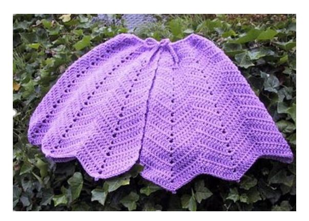
Cape -- Original Image: from <a href="http://suzies-yarnie-stuff.blogspot.com/2010/07/ripple-capelet.html">http://suzies-yarnie-stuff.blogspot.com/2010/07/ripple-capelet.html</a>

My version is derived from the above cape.